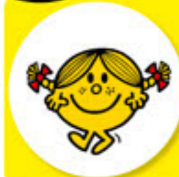
Little Miss Sunshine

Everyone in Miseryland really needs cheering up, don't they? Who do you think would be good at that?