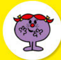
Little Miss Bad